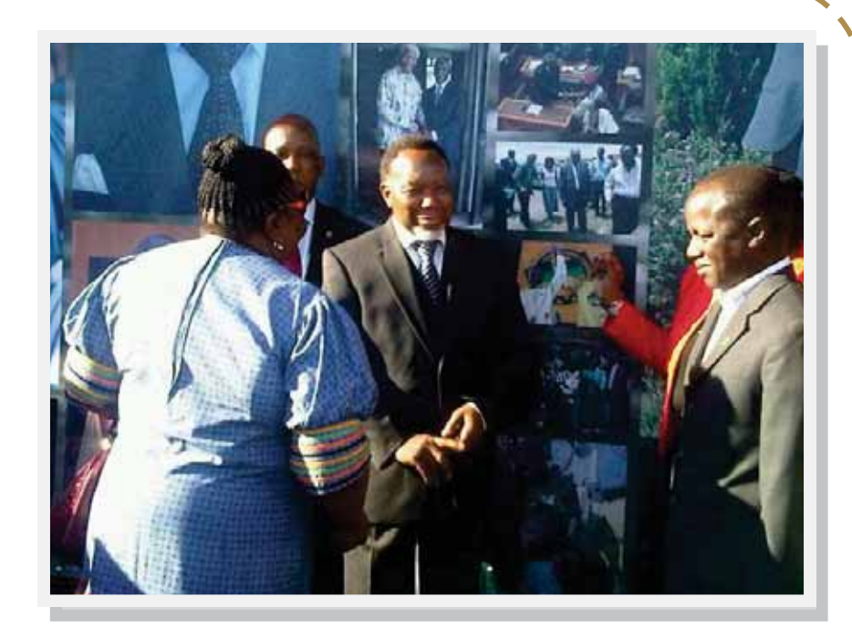
The Deputy President, Premier of the Eastern Cape and Minister in the Presidency