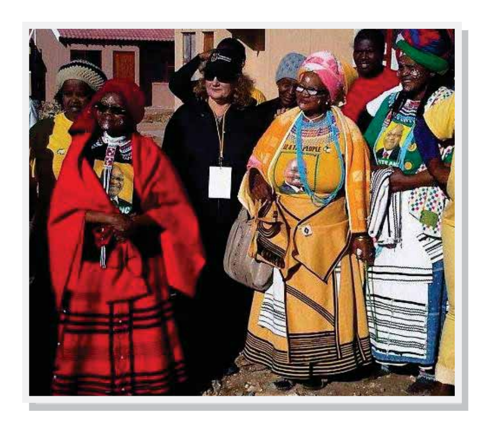
Members of the community listening attentively to their leadership

On this day the Deputy President and his delegation visited a Housing Project in Chetty, Port Elizabeth where they were met by young people working on the project and was briefed on what they are doing. The Deputy President and his delegation also as-